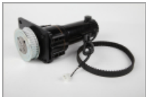
93-30-2111 QTY: 1 MOTOR, SMTC CAROUSEL 40T