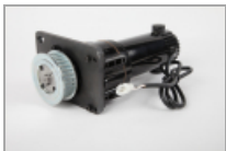
93-1664 QTY: 1 MOTOR, SMTC CAROUSEL 50T