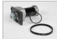
93-1642 QTY: 1 MOTOR, SMTC CAROUSEL 30/40T