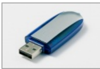
USB memory device